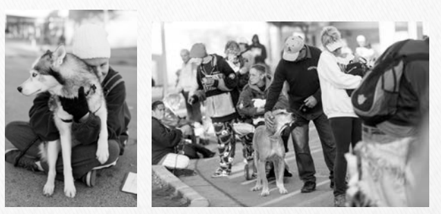
FRIENDS OF ANIMAL CARE & CONTROL HUMAN SERVICES EVENT December 14, 2014

Friends of Animal Care & Control, Lulu's Fund, Cause for Paws and MCACC were on-site at the Human Services campus handing out food, collars, leashes and carriers, while providing spay/neuter, vaccinations and flea/tick medication.