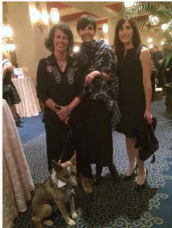
FRIENDS OF ANIMAL CARE & CONTROL 12 th ANNUAL HERO AWARDS DINNER February 28, 2015

Lulu's Fund was proud to be a Top Dog sponsor for Friends of Animal Care & Control 12th Annual HERO Awards Dinner held on February 28, 2015 at The Montelucia Resort in Paradise Valley.