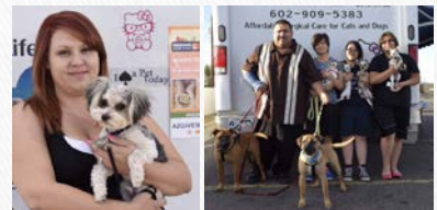
Arizona Gives Day, April 7, 2015