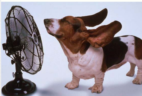
"It might be hot out there but supporting free spay & neuter is hotter!"

Lulu's Fund is proud of its continued partnership with Friends of Animal Care & Control to assist in providing free spay and neuter services to our community.