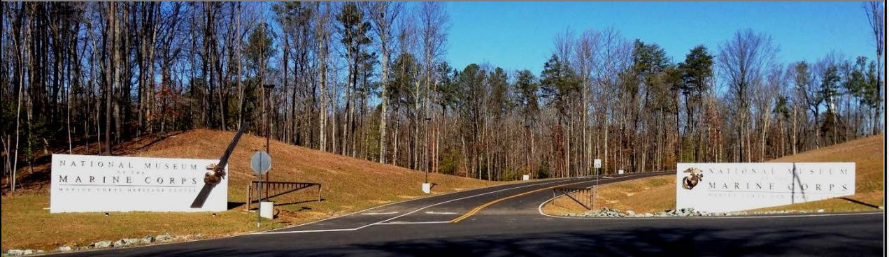
THE HERITAGE PARKWAY ENTRANCE IS COMPLETED!