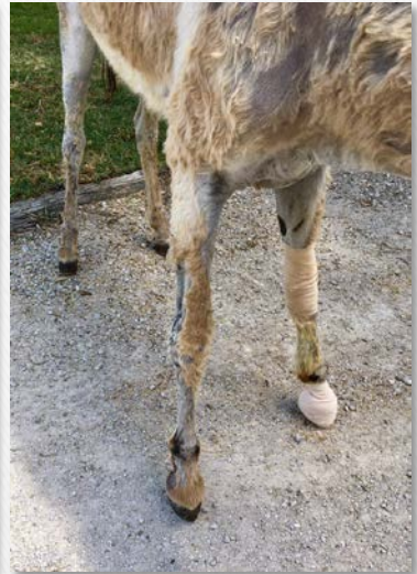
Belle, before and after her treatment

affiliated hospital in Texas before relocating to AGN's sanctuary in Arizona. She now receives plenty of love while she continues to heal.