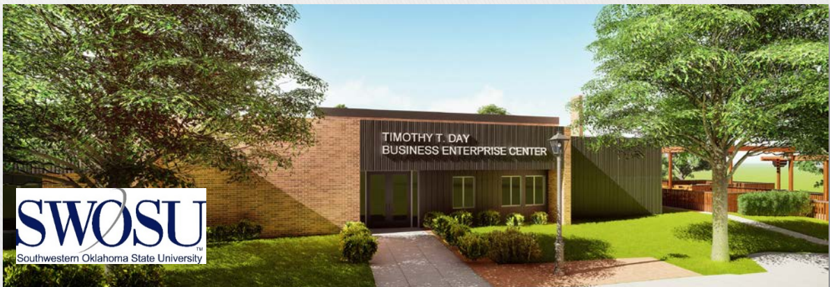
Architectural renderings of the Timothy T. Day Business Enterprise Center post-refurbishment.