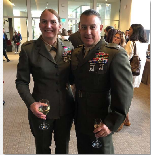
AMP Graduation, October 2019